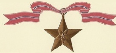
THE BRONZE STAR MEDAL FOR MERITORIOUS SERVICE