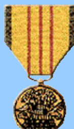
Vietnam Service Medal