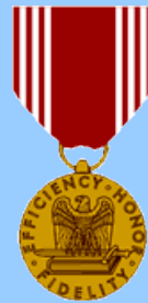
Good Conduct Medal