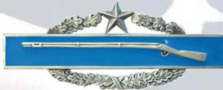
Combat Infantry Badge, 2nd award