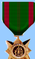
Vietnam Civil Actions Medal