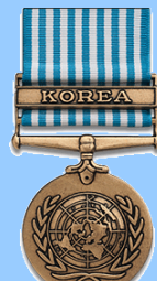
U. N. Service Medal (Korea)