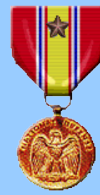
National Defense Medal